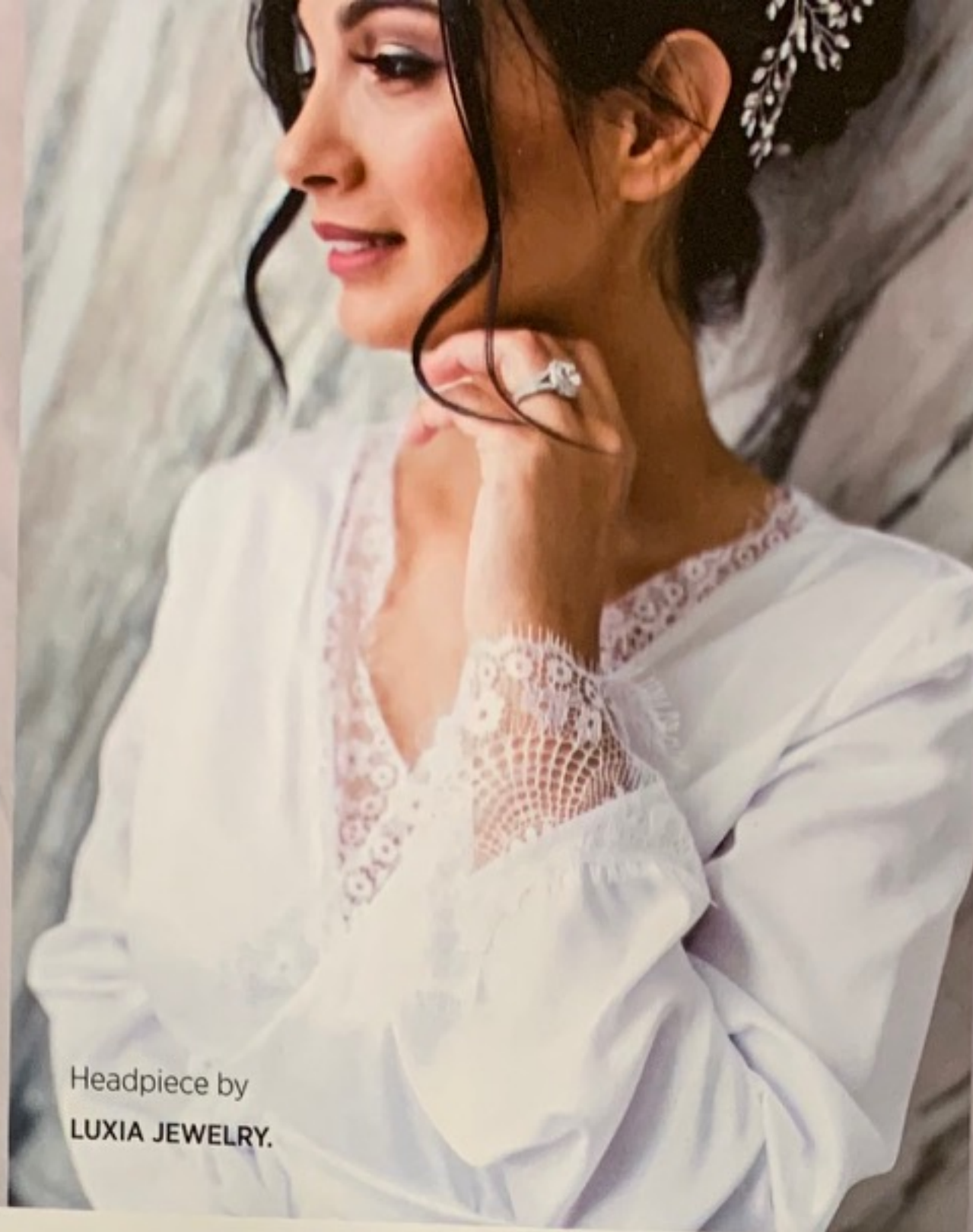
Headpiece by LUXIA JEWELRY .