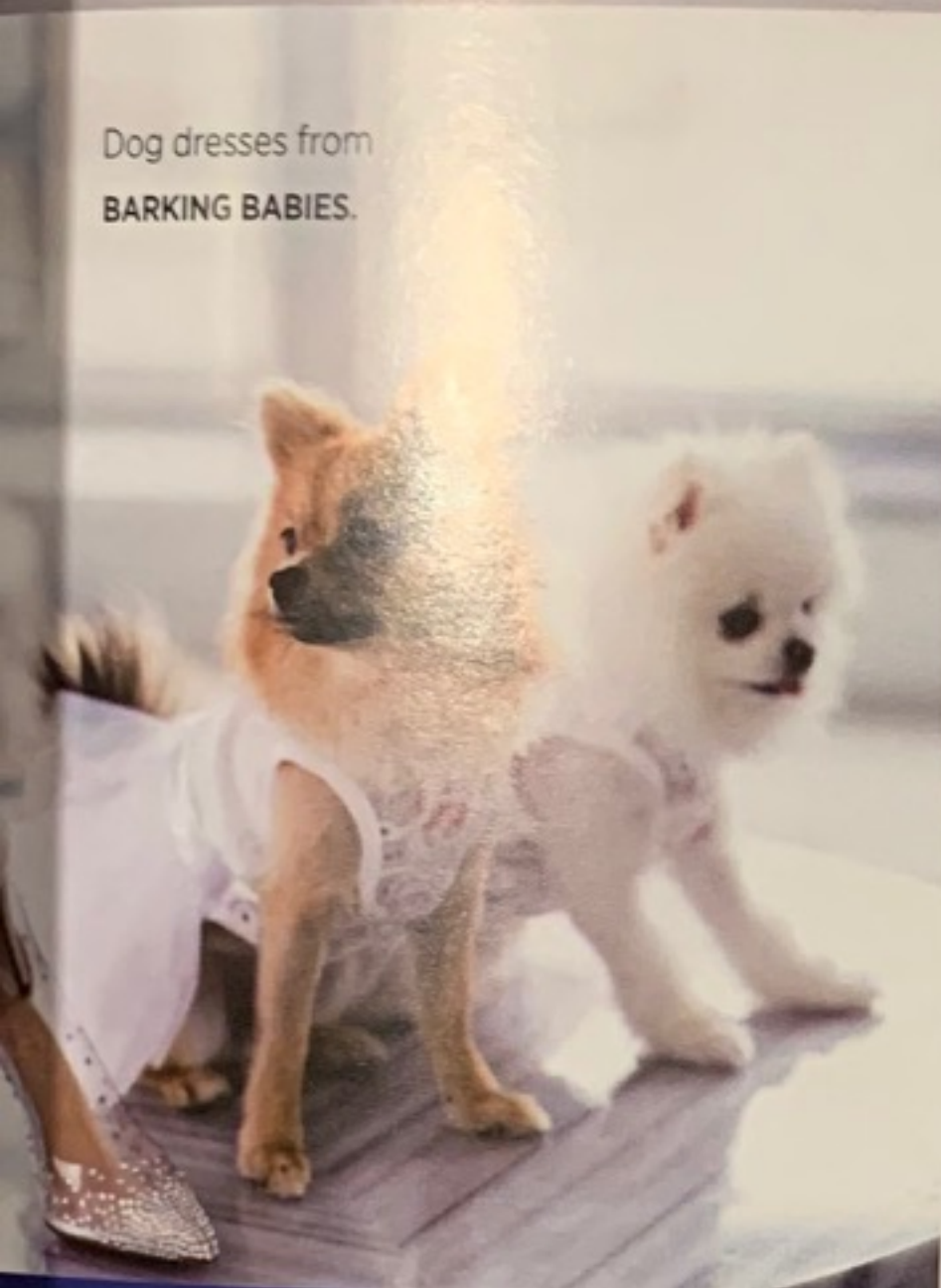
Dog dresses from BARKING BABIES .