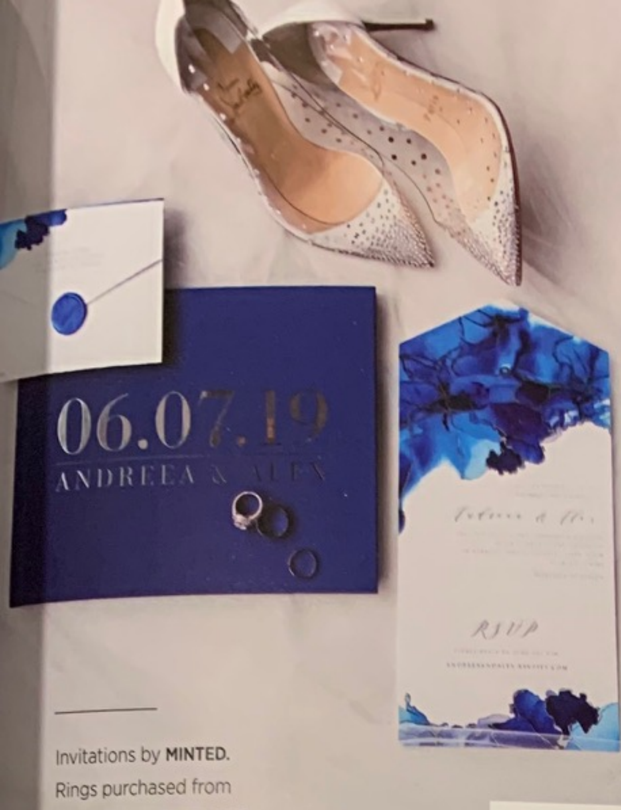
Invitations by MINTED . Rings purchased from MINICHELLO JEWELLERS .