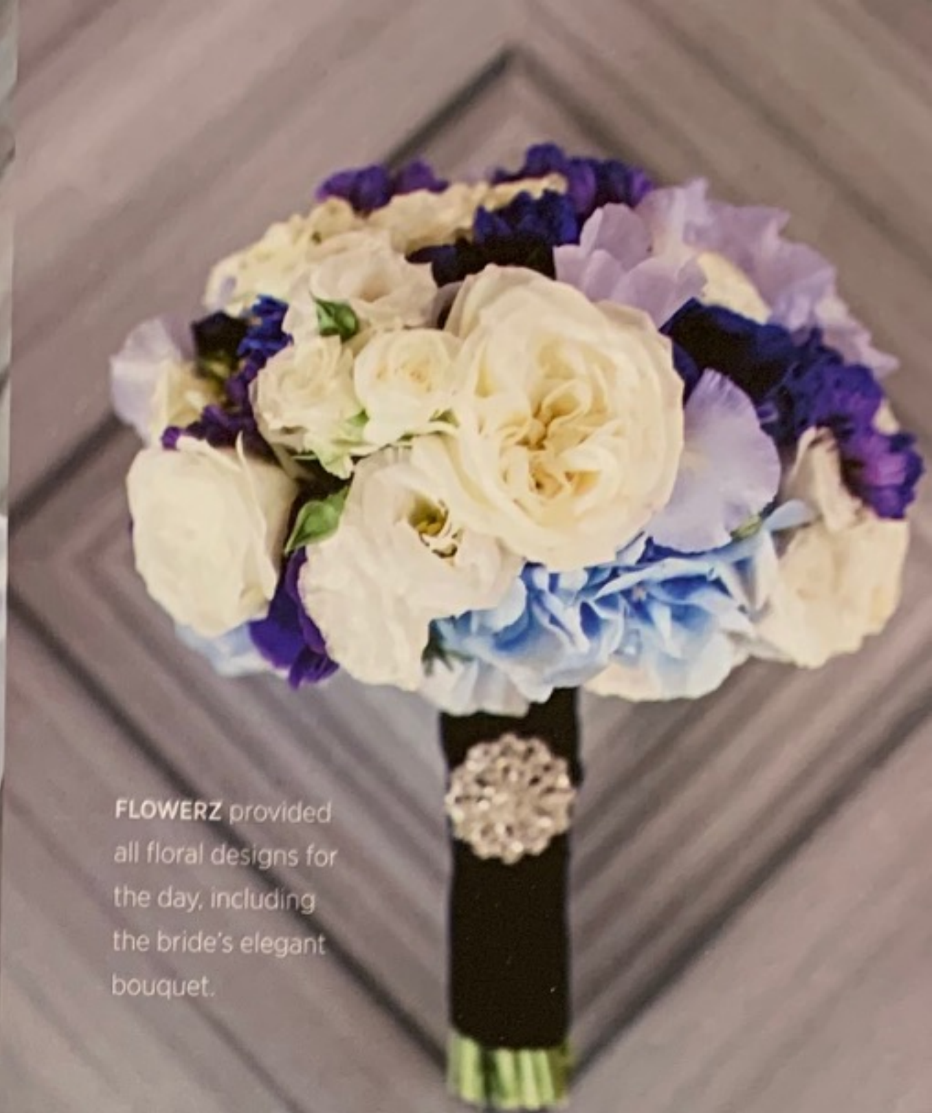
FLOWERZ provided all floral designs for the day, including the bride's elegant bouquet.